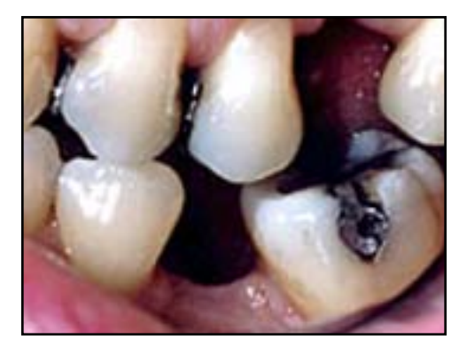
Teeth can shift

If you're interested in replacing a missing tooth with an implant, we will perform a thorough evaluation to determine whether your health and lifestyle make you a good candidate for this kind of restoration.