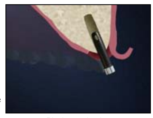
Placing an implant