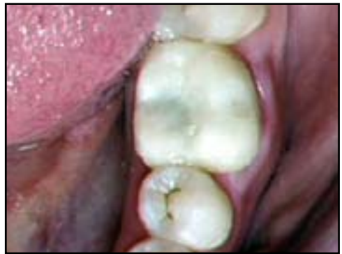
Porcelain inlays look natural